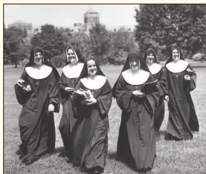
Sisters of the Servants of the Immaculate Heart of Mary.